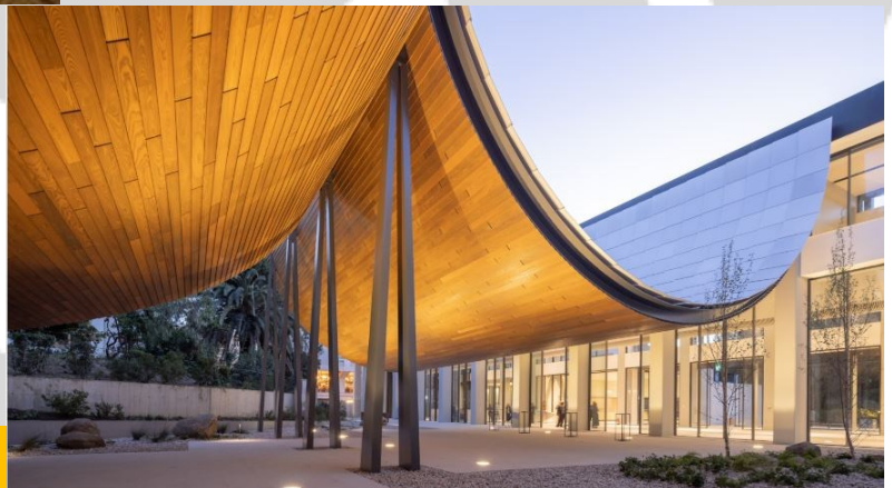
CAM: CENTRO DE ARTE MODERNA

CAM's New Building and Garden. CAM's new building was reimagined by Japanese architect Kengo Kuma, who collaborated with landscape architect Vladimir Djurovic, to perfectly integrate architecture and nature. The large canopy covered in white tiles with soft, organic lines which now marks the façade of the new building transforms its main entrance into an area of passage between CAM and the garden. More+