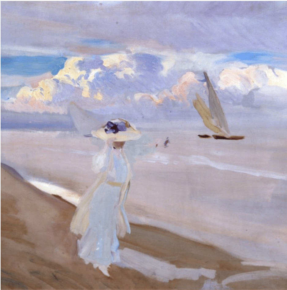
In Sorolla's Sea with Manuel Vicent

Following its initial showing in Madrid, the exhibition is now being presented in Valencia with an expanded selection of works that includes 109 canvases dating from between 1886 and 1920. The exhibition includes masterpieces by Sorolla that have exceptionally left their headquarters at the Museo Sorolla in Madrid, such as Saliendo del baño (1915), La hora del baño, Valencia (1909), Pescadores valencianos (1903) and Después del baño, Valencia (1909). More+