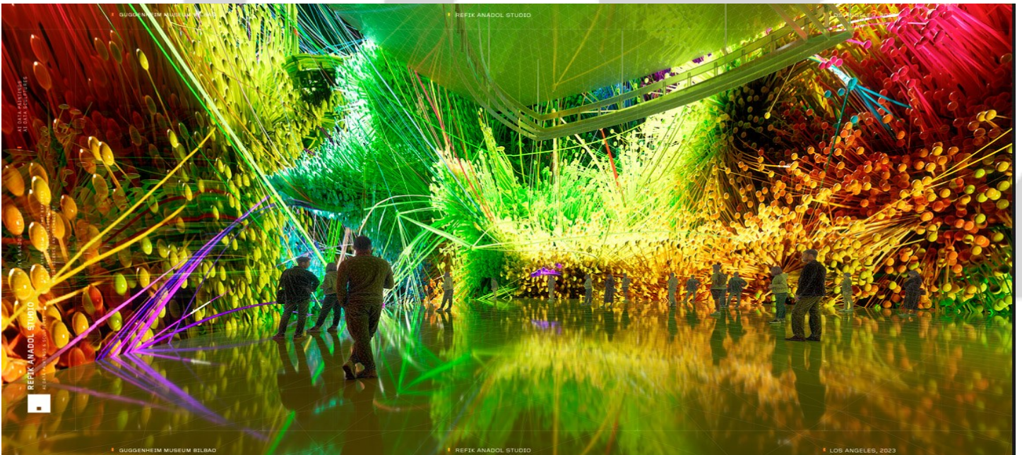
in situ: Refik Anadol The Guggenheim Bilbao Museum 7 March -19 October 2025

The inaugural in situ exhibition will be an immersive, architectural, and multisensory artwork by Refik Anadol, an internationally renowned media artist and pioneer in the aesthetics of machine intelligence. Anadol currently resides in Los Angeles, California, where he leads Refik Anadol Studio whose practice is centered around discovering and developing trailblazing approaches to data narratives. More+