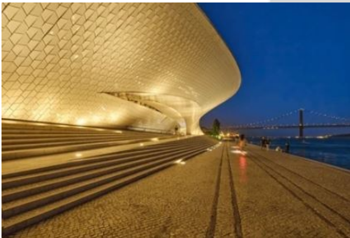
MUSEUM OF ART, ARCHITECTURE AND TECHNOLOGY

CAM's New Building and Garden. CAM's new building was reimagined by Japanese architect Kengo Kuma, who collaborated with landscape architect Vladimir Djurovic, to perfectly integrate architecture and nature. The large canopy covered in white tiles with soft, organic lines which now marks the façade of the new building transforms its main entrance into an area of passage between CAM and the garden. More+