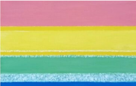
The Light of the Marina Alta